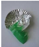
Foil cup, plastic food divider for ben Aluminum pack