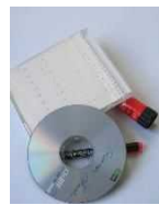
CD case, CD