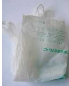
Plastic bags (Plastic shopping bags, etc.)