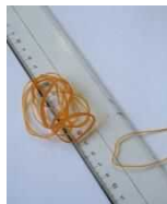
Rubber bands, plastic stationery