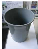
Plastic trash cans