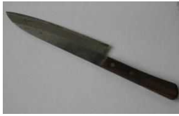
Kitchen knives, knives (Please wrap with a cloth or tape to prevent injury.)