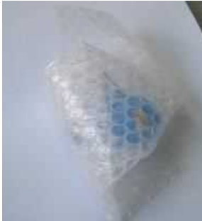
Plastic cushioning material to wrap fragile items