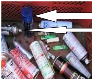
Plastic caps for cosmetics and spray cans that are marked "plastic"